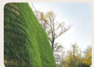
Mechanically Stabilized Earthen (MSE) Wall: Raleigh, NC