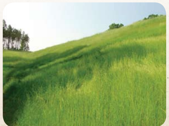
Application and Rapid Results: Highway Project

The result of Green Design Engineering is sustainable erosion control, even under harsh soil conditions and on severe slopes and channels. This serves as added peace of mind that every site keeps soil and sediment in place—while restoring or creating a natural landscape that's more aesthetically pleasing and more ecologically productive. Through Green Design Engineering, Profile is the industry's true 'green' solutions provider, delivering first-time, cost-effective and long-term success.